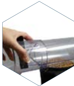
3. Level grain