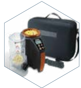
Package includes: mini GAC™ 2500, loader, 9 volt battery**, carrying case, instruction manual and 1 year manufacturer's warranty