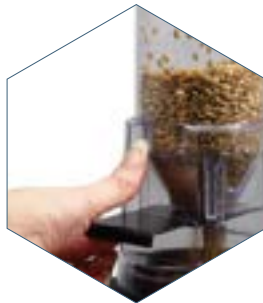
2. Empty loader into analyzer