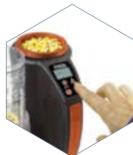
4. Press button, results in seconds